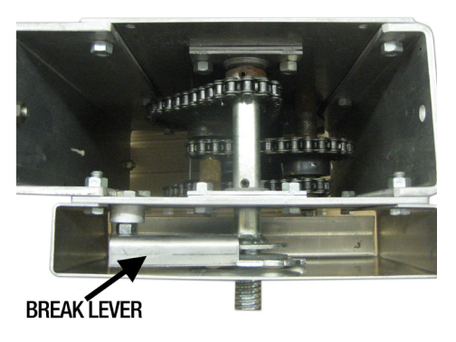
3. Remove Break Lever. You Will Not Use it Any Longer.