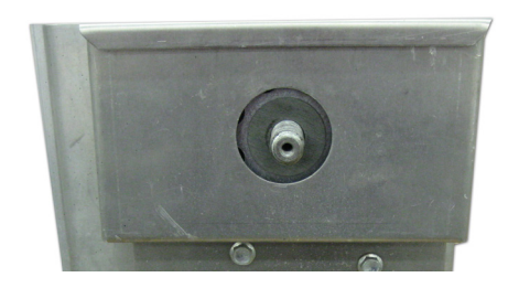
1. Lower Boat Lift. 2. Remove Wheel Nut and Wheel.

Always Lower The Boat Lift Before Attempting Assembly.