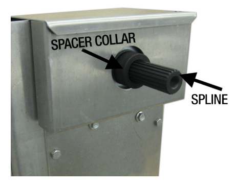
4. Install Spacer Collar and Spline.