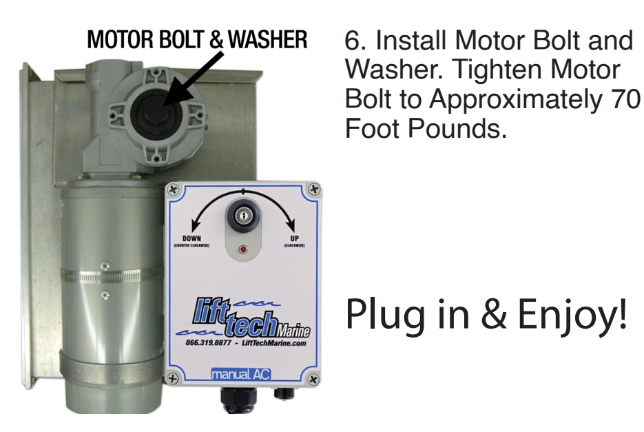
Plug in & Enjoy!